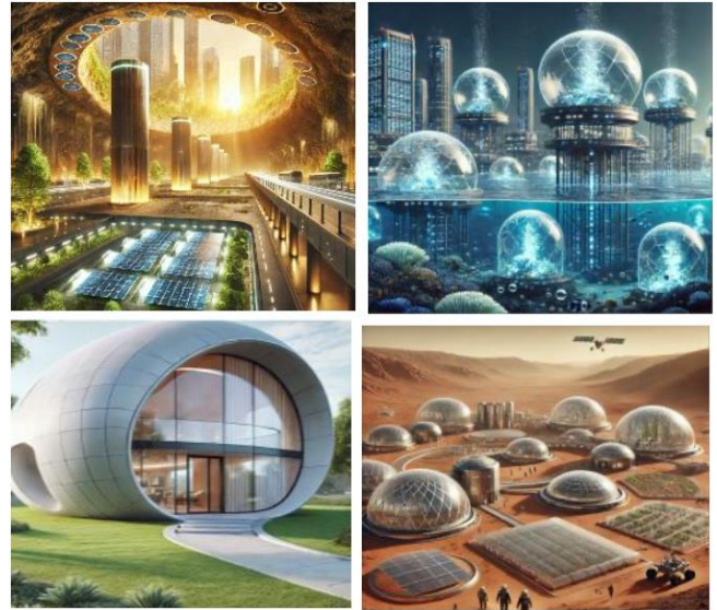
Figure 4. Plan B is needed to save humanity in case the global government's legislative efforts fail [21-26]. This plan includes, but is not limited to, building underground solar cities (top left), underwater cities (top right), eco-friendly homes (bottom left), or colonizing the Moon or Mars (bottom right) as the next generation's new homes by the start of the next century. Four written prompts describing what the ChatGPT mobile app needs to create images

Winning the fight against global warming is possible with international collaboration and global investments in environmentally friendly energy technologies. Alternatively, although it may seem dystopian, a contingency plan is urgently needed as conventional ways to serve the environment may fail to save the Earth. Based on our Figure 3 and based on the linear and polynomial analysis, we could see an alarming 2.5 °C or 3.5 °C by 2060, respectively. A UN report warns that an increase of 3.1 °C is inevitable by 2100 without greater action [28]. The 3 °C is extremely devastating to humans, animals, plants, and insects as well as to Earth's health [28].