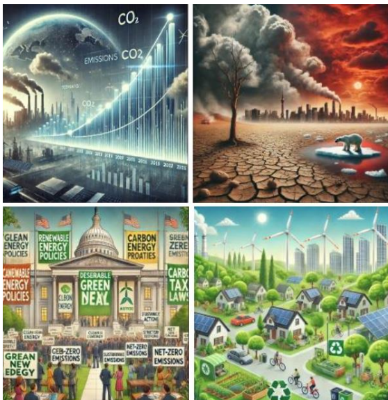
Figure 1. Global warming is taking over the planet, and due to greenhouse gas emissions (top right), it could make the earth uninhabitable (top right); legislative action from governments (bottom left) around the globe could overturn global warming (bottom right). The ChatGPT mobile app was used to create images

Most lives are driven by fossil fuels for gas and electricity. People fuel fossil fuels and deforestation primarily through various activities that reflect modern lifestyles and economic practices. Every time a person leaves the house, they use some transportation or resource that requires fossil fuels. People's lives are like the fuel feeding the fire of global warming, just like how we put fossil fuels in our vehicles. Everything a human does impacts the environment. Most homes and appliances are made of wood, and forests must be cut down to get wood. The more people on the Earth, the more destruction is done. All "greenhouse gases increase due to human activities," and therefore "the basic radiation balance is altered" [4]. CO 2 emission is one major factors of greenhouse gases that increased exponentially over the last few decades. Using currently available statistical data [8-9] and Excel extrapolations, the CO 2 emission could reach 500 ppm in 2050 if the current CO 2 emission trend is not mitigated (see Figure 2).