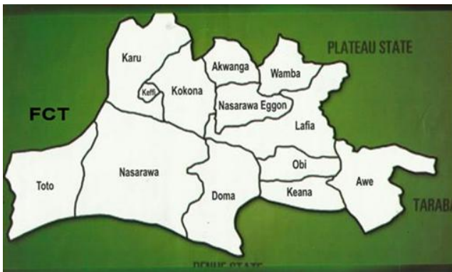
Figure 1. Map of Nasarawa state, Nigeria [15]

Nasarawa State is centrally located in the Middle Belt region of Nigeria and lies between latitude 7^{\circ} 45' and 9^{\circ} 25' N of the equator and between longitude 7^{\circ} and 9^{\circ} 37' E of the Greenwich meridian. It shares a boundary with Kaduna state in the North, Plateau State in the East, Taraba, and Benue states in the south while Kogi and the Federal Capital Territory flank it in the West (Figure 1). The state has a total land area of 26,875.59 square kilometers and a population of about 1,826,883, according to the 2006 population census estimate with a density of about 67 persons per square kilometer. The soils are rich in humus and laterite and are found in most parts of the state which adequately supports crop production [15]. Nasarawa state experiences extreme seasonal variation in monthly rainfall with the rainy period of the year lasting for over 8 months (March to November) and a sliding 31-day rainfall of at least 0.5 inches. The most