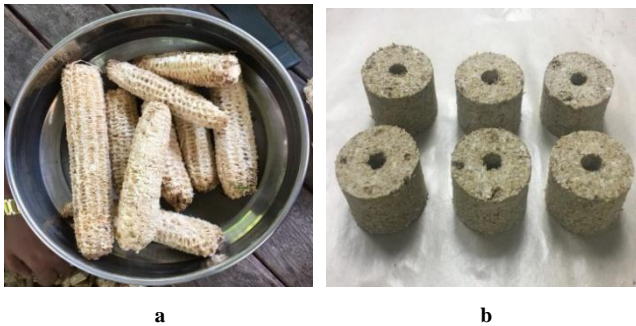
Figure 2. Sample of agricultural residue (a) and produced briquettes (b)

Briquettes are a form of solid biofuel that can be burned for energy made from biomass resources including agricultural residues (Figure 2). They are made of different qualities and dimensions depending on the raw materials, mold and technologies applied during production [27,28]. They are typically cylindrical in shape with a diameter of between 25 and 100 mm and lengths ranging from 10 to 400 mm [29]. Other shapes of briquettes include square, rectangle and polygon and also in different sizes. The use of agricultural residues to produce briquettes can reduce waste of resources and consumption of fossil fuels [30]. Production of briquette helps to solve the problem of residue disposal and deforestation which eases the pressure on the forest reserve. [31]. The advantages briquettes have over conventional fuelwood include higher heat content, ease of use, cleanliness and compact size [32].