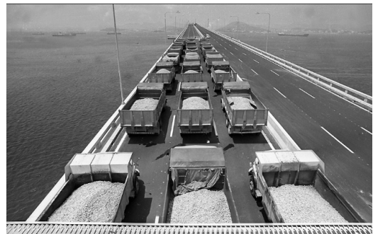
Figure 1. Proof Load Test on Rio-Niterói Bridge.

Formerly bridge monitoring and testing were characterized by observation process of structural behavior, techniques conceptions and appropriate equipments. At this time, calculus methods were reduced, being common the use of simplified models for complex structures analysis. With these conditions, the information obtained through monitoring was more relevant for safety verification [4].