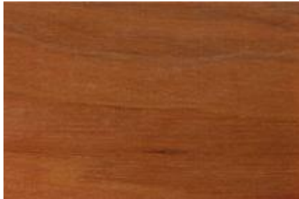
Figure 1. Image of the Dinizia excelsa Ducke

The wood Dinizia excelsa Ducke., displayed in Figure 1, present in Brazilian states of Acre, Rondônia, Amazonas, Pará, Roraima, Amapá e Maranhão becomes a great option, especially to Amazonian part of Brazil, the west and southeast part of Brazilian country, where the production of this wood specie is more noticeable [11].