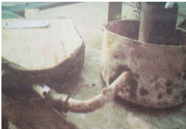
Figure 2. Bellow and Crucible furnace set-up

The furnace set-up is shown in figure 2 on charging the furnace with the carbonised palm kernel shell the fuel is ignited with an ember; after ignition the crucible is lowered into the combustion chamber with the charge inside, the bellow is operated continually until the charge becomes molten and the crucible is lifted out with a thong and the molten metal is poured into the mould.