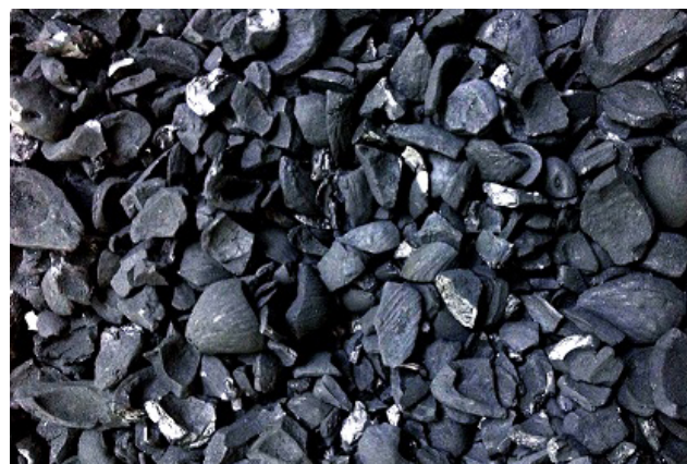
Figure 3. Carbonized Palm Kernel Shell (PKS)

of solid eventuated by the pyrolytic action under a controlled atmosphere. Figure 3 below shows the carbonized PKS.