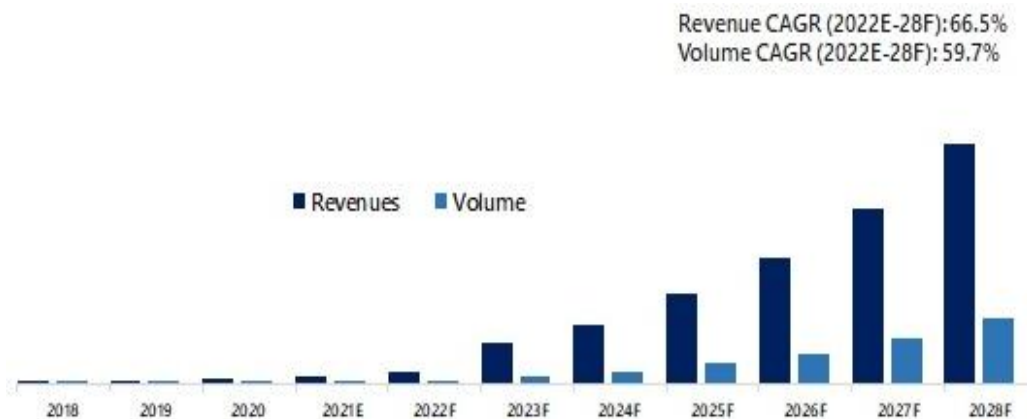
Figure 1. Kuwait electric vehicles market revenues and volumes [10]

According to the figure, Kuwait's market for EVs is still beginning to grow, but it will grow at a compound annual growth rate (CAGR) of 66.5%. Compared to Kuwait, the UAE has made more progress in promoting EVs. A report compiled by Sharma [12] indicates that the UAE is among the top ten countries in the world in terms of preparedness for electric mobility.