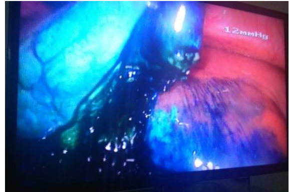
Figure 2. Extraversion of dye