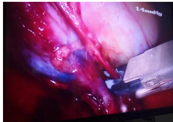
Figure 4. Delineation of gall bladder & cystic duct