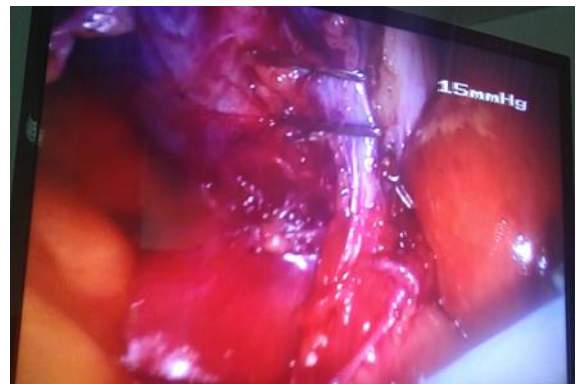
Figure 5. Delineation of cystic & CBD