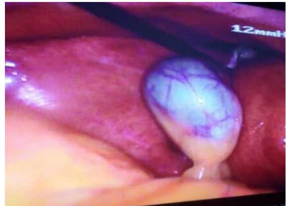
Figure 3. Delineation of gall bladder